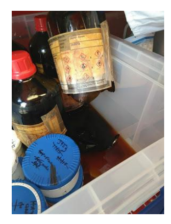
Figure 2 – Maximum fill height of a Winchester and the consequences of overfilling and incorrect use