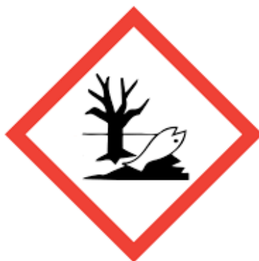
Figure 1: Hazard symbol 'Dangerous for the environment'

In addition to this, any substance that is identified as environmentally hazardous cannot be disposed of via the drain network. This can be checked by reviewing the hazard/risk phrases on a substances packaging and/or Material Safety Data Sheet (MSDS) and for looking out for symbol shown in Figure 1 and hazard phrase HP14 - Ecotoxic.